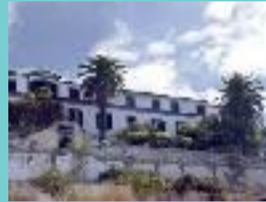
Casa Saúde Câmara Pestana - Funchal