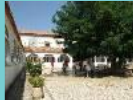
Centro de Recuperação de Menores