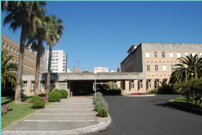
Clínica Psiquiátrica São José