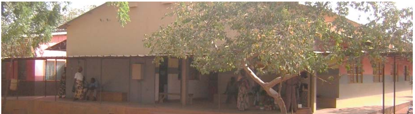
"Yendube" Children's Hospital