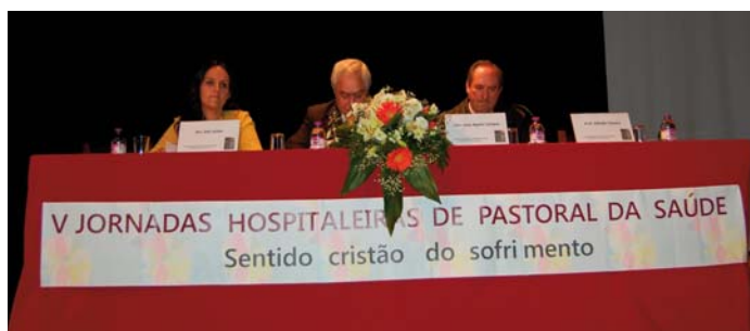
V Hospitaller Pastoral Health Care Days