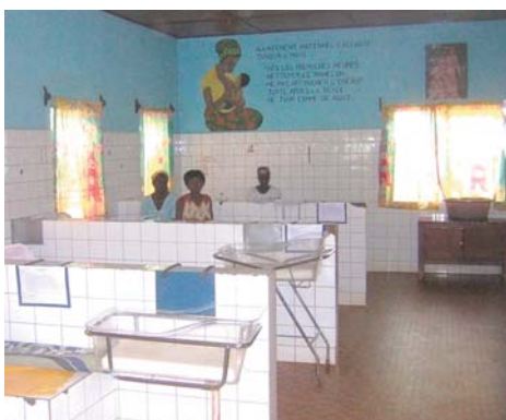
"Yendube" Children's Hospital

In 1962, four Augustinian Hospitaller Sisters from Cambrai and one laywoman were sent on a mission to Dapaong in Togo to provide care for the sick children in the region. On 8 December 1962, the "YENDUBE" children's hospital opened its doors. The sisters provide care, educate the mothers, vaccinate and surround themselves with lay staff whom they teach about care, diseases, etc. Other sisters and laypeople quickly came to join the small community.