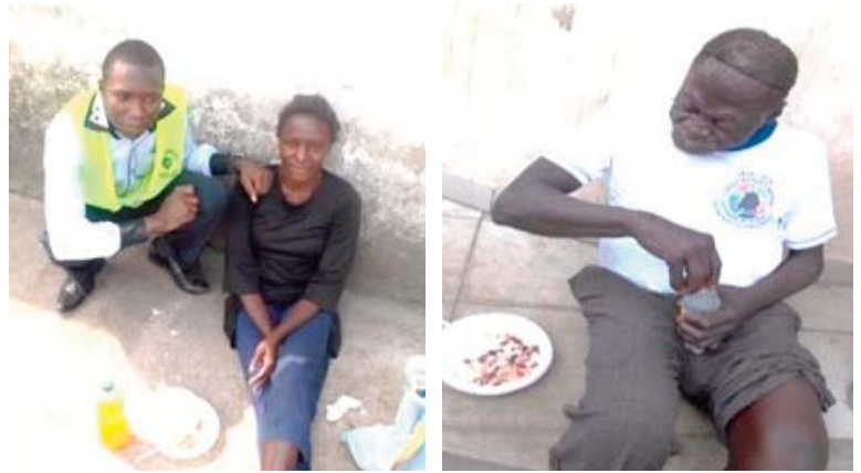
Volunteering at the Saint Benedict Menni Mental Healthcare Centre