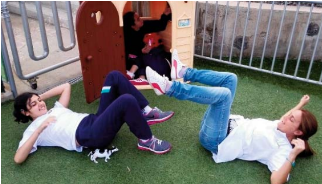
Activities of the ACAMAN Leisure Club